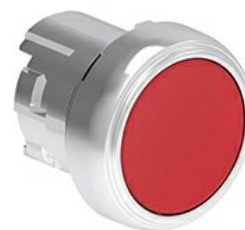
Pushbutton actuator, spring return LPSB10