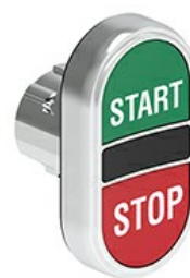
Double-touch actuators, spring return - two flush pushbuttons LPSB71