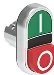
Double-touch actuators, spring return - One extended and one flush pushbuttons LPSB72