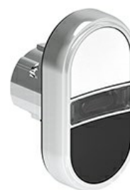
Double-touch actuators, spring return white indicator - Two flush pushbuttons LPSBL71