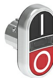
Double-touch actuators, spring return white indicator - Two flush pushbuttons LPSBL71