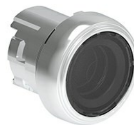
Illuminated push- push button actuators - Flush LPSQL10